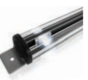
Optimax Pro 24 LED