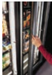
Full Length Handle