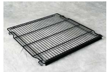
Available in white or black, Gemtron shelving features a user-friendly, durable design.