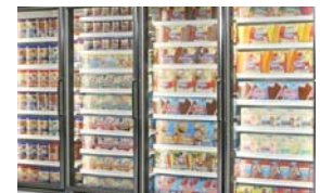
Polar™ door systems from Gemtron deliver durability and efficiency in rugged low-temperature applications.

In low-temperature environments, retailers are looking for high performance, durable construction, and exceptional energy efficiency—and Polar™ door systems from Gemtron were developed with these real-world needs in mind. With industry-leading product features, Polar™ sets the standard for low-temperature displays.