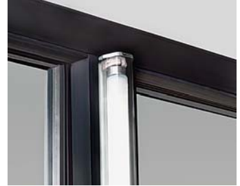
With their unique lens design, Gemtron lighting systems deliver up to four times the center-shelf illumination as competitive systems.