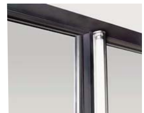
Like all Gemtron door systems, Yukon™ models feature high-efficiency T-8 lighting

Gemtron's Yukon™ product family combines outstanding performance with extremely attractive value. With a solution for every environment—normal-temperature, normal-temperature with heat, and low-temperature—Yukon™ products offer many features typically found in higher-end door systems.