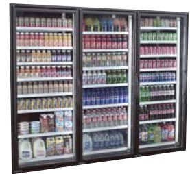
Gemtron's Tundra™ offers outstanding protection against condensation—while also achieving excellent energy efficiency.

Gemtron's Tundra™ door system is perfect for energy-conscious retailers—combining practical features such as energy efficiency and low maintenance with an attractive design that protects against condensation up to 72% relative humidity. Built for normal-temperature environments, Tundra™ delivers rugged, durable, reliable performance.